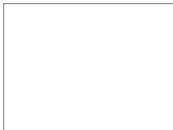
Quinacridone Magenta* (Transparent)