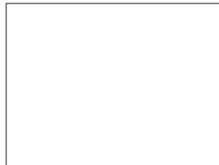
Raw Sienna (Semi Transparent)