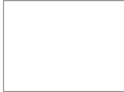
Phthalo Green (Yellow Shade)* (Transparent)